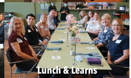
Lunch & Learns