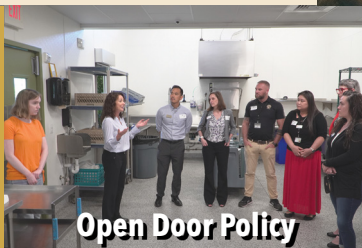
Open Door Policy