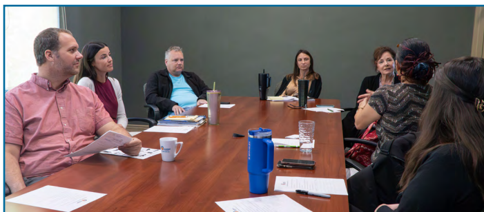
Academy at Glengary Business & Technology Team Goal Planning