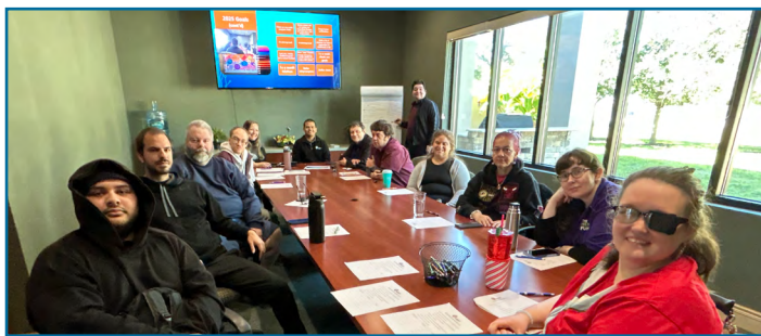
Academy at Glengary Graphic Design & Multimedia Team Goal Planning