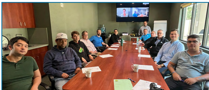
Academy at Glengary Culinary Team Goal Planning