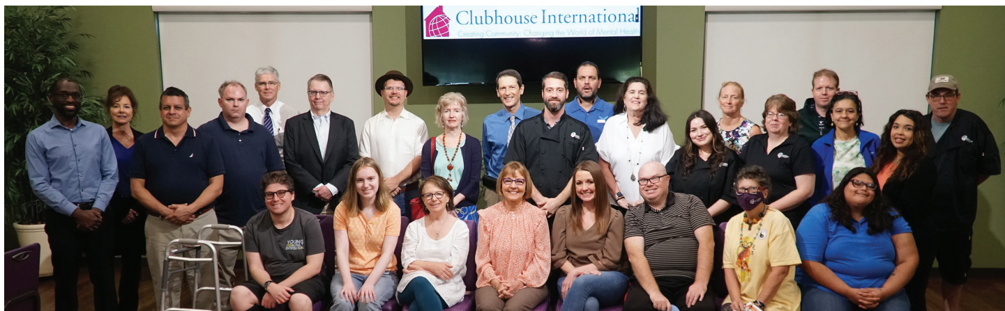
Academy members, staff, board, and families listened to the accreditation team findings.