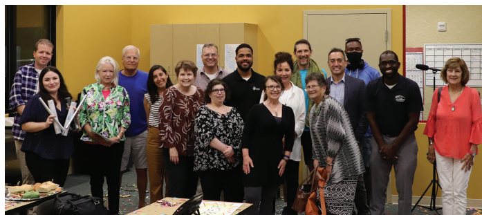
Just a few of the volunteers with members and staff after the telethon ended.